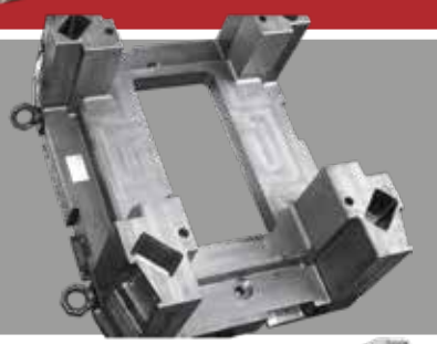
MOULD SUPPORT Material: Alloy Steel Weight: 6 t