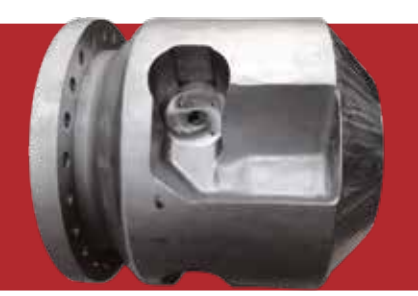
SPOOL Material: Duplex Weight: 3.5 t