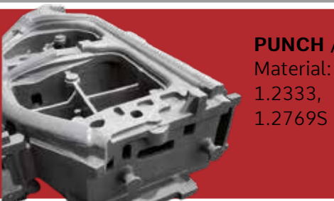
PUNCH / UPPER PAD Material: Cast Steel 1.2333, 1.2320, 1.0446,